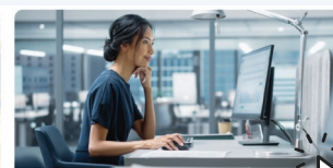
成員講座 Member Seminar >